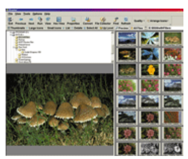
File viewer allows you to see folders in upper left, thumbnails on right, and enlarged image in lower left. Toolbars at top give you options to change viewing settings, or jump to other portions of the program.

You can also store your files on removable data by using PentaCD, create self-running programs with PentaZip Script or set up scheduled functions using PentaZip Scheduler. Other file utilities in PentaSuite include a file splitter, script wizard, encryption wizard, and a self-extracting file manager. The combination of these utilities with the main PentaSuite program gives